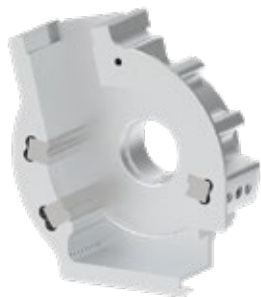
Tool-free replaceable milling chamber of the SM 50

A key feature of the SM 50 is the simple and flexible interchangeability of the grinding tools. This allows the system to be specifically adapted to different samples and analytical requirements. The focus is on a clear approach: abrasion must not only be accepted, but actively controlled.