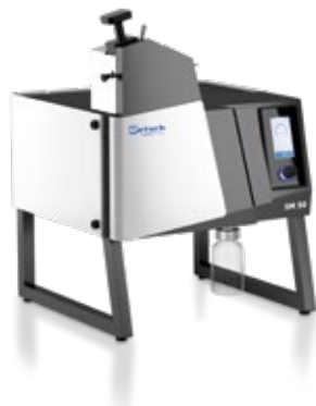
RETSCH Cutting Mill SM 50

For laboratories, this poses a significant risk – ranging from unnecessary re-analyses to incorrect evaluations. Even small additional inputs during sample preparation can therefore have significant consequences. Sample preparation is thus not a neutral step, but a potentially decisive factor influencing the analytical result.