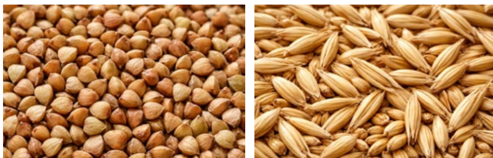
Pictures of the two samples before grinding: buckwheat (left) and oats with husks (right).